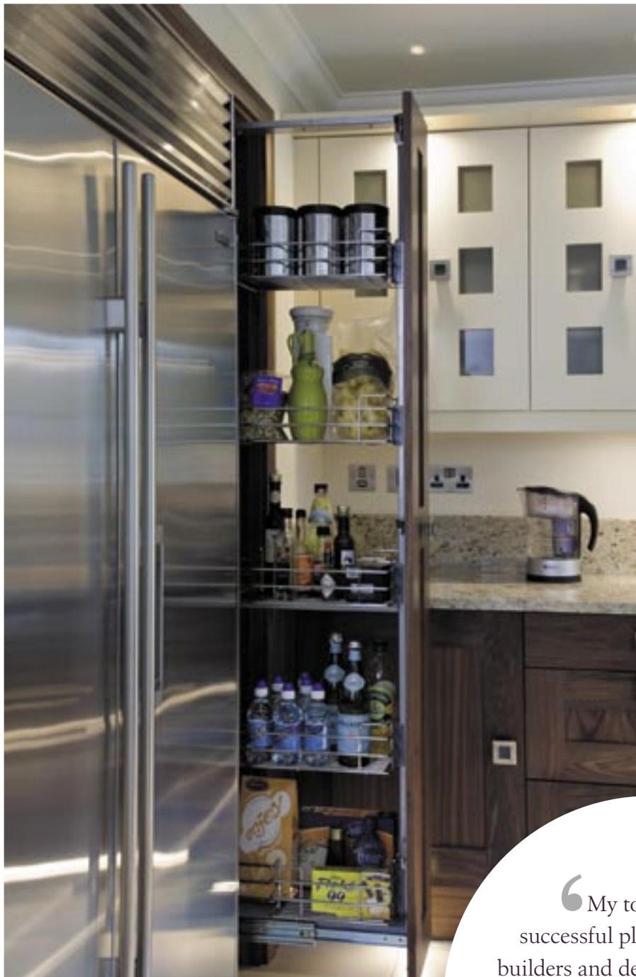
▲ A Sub-Zero American side-by-side fridge freezer and a pull-out larder that offers clever storage for bottles and jars are both located next to a worktop, so Vivian is able to access chilled and dry goods easily when preparing meals