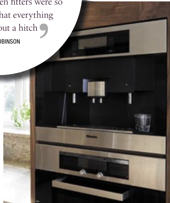
▼ The built-in coffee machine is Vivian's favourite appliance. 'I really like it,' she smiles. 'It has so many options and you can pre-programme it, too. We love sitting at our breakfast bar in the mornings with a freshly brewed coffee'